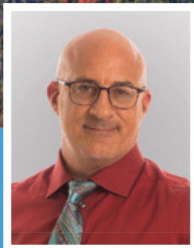
Keynote Speaker Jim Cantore